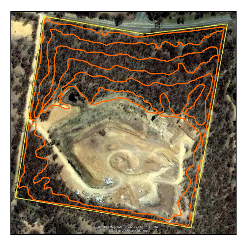
Figure 3 Indicative locations of survey transects (base plan: GoogleEarth satellite imagery).

A comprehensive pedestrian survey of the relatively undisturbed 3.85 ha area around the periphery of the existing tip was carried out on 6 August 2009 by the consultant, Patricia Saunders, and Ngambri LALC representative, Tiana House, in accordance with the requirements of New South Wales National Parks and Wildlife Service (1997) Aboriginal Cultural Heritage Standards and Guidelines Kit. The survey involved an examination of the ground surface for the presence of Aboriginal stone artefacts and an inspection of old growth eucalypts for evidence of traditional Aboriginal bark removal. The indicative locations of survey transects are shown in Figure 3.