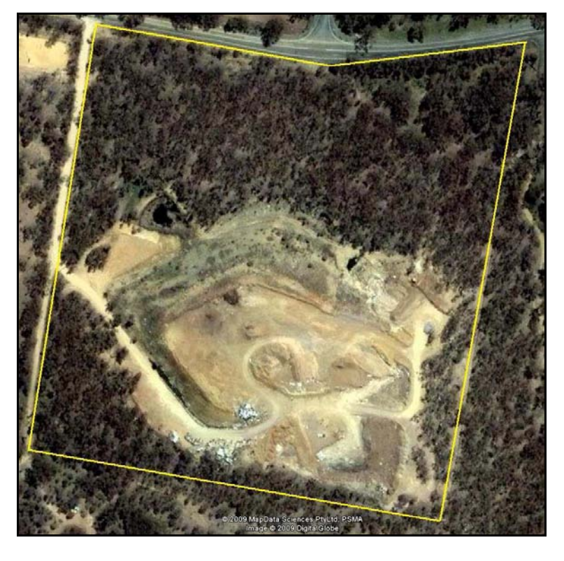
Figure 2 Macs Reef Road tip site (base plan: GoogleEarth satellite imagery).